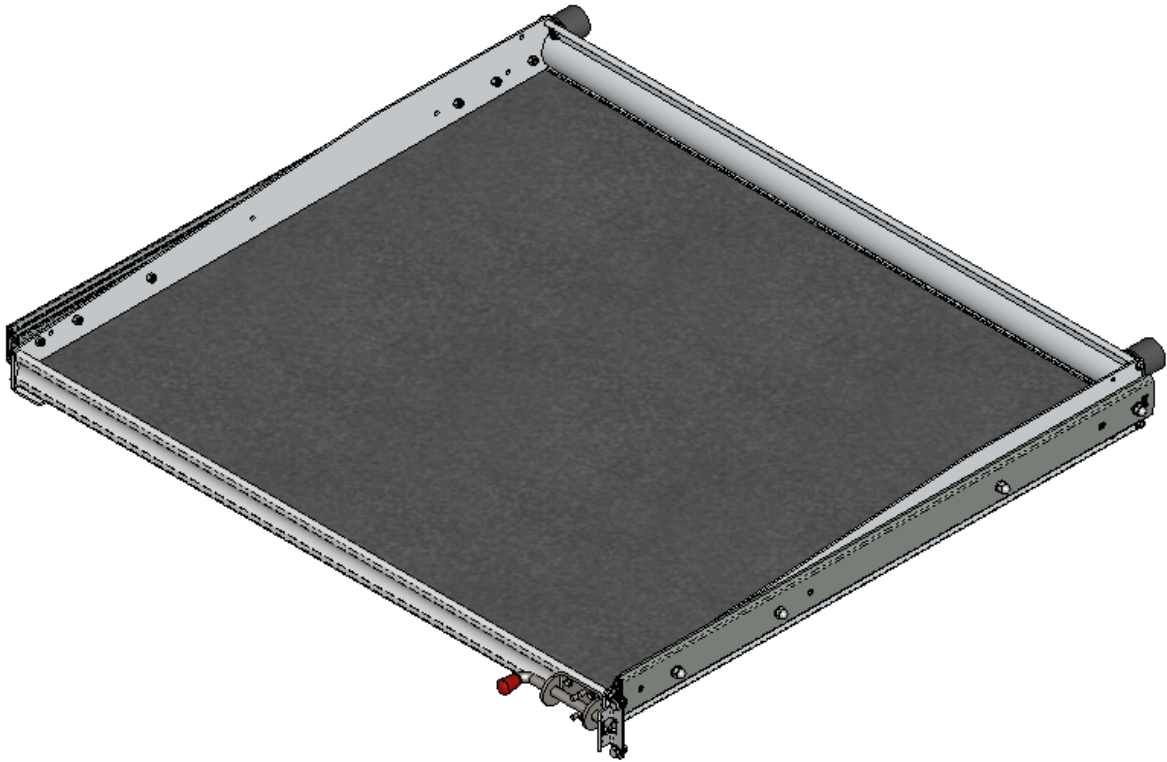
5037-A Axess Tray Sliding Cargo Tray